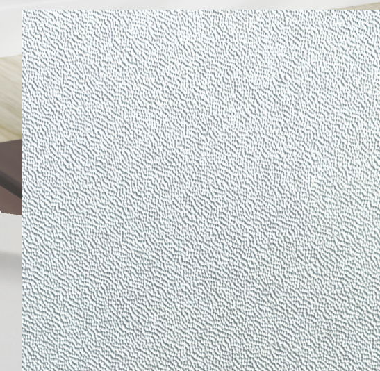
Anti Slip Surface