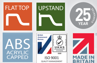
Smooth Gloss Surface