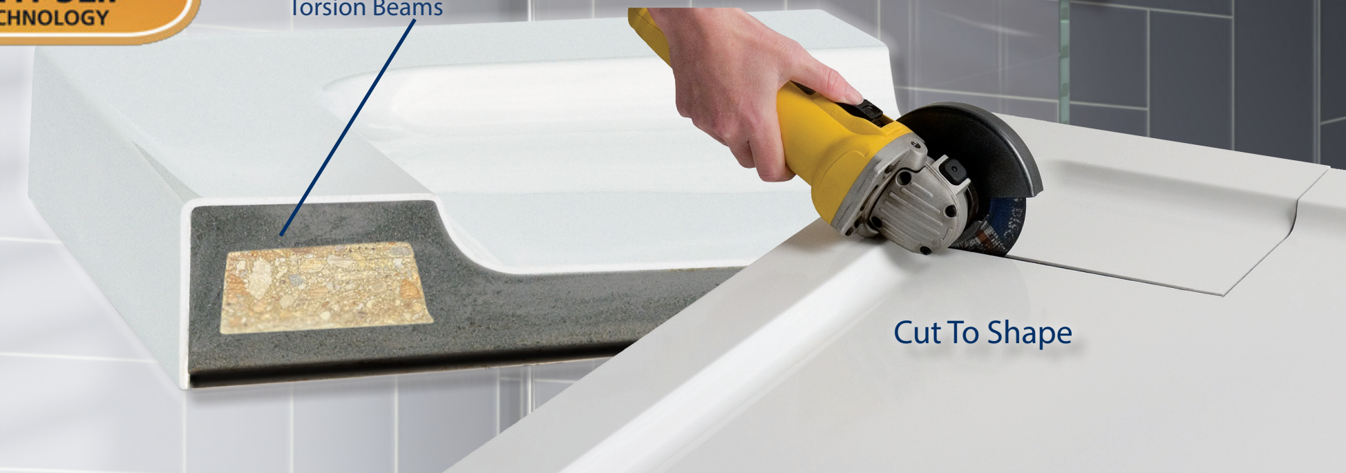
Cut To Shape